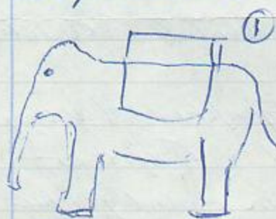
NEAR COMPLETE SKIN FIXING AND COLOURING

I spent the 25, 26, 27 & 28 July in Thaxted waiting for completion of my Jenny. I saw the production line -!!!