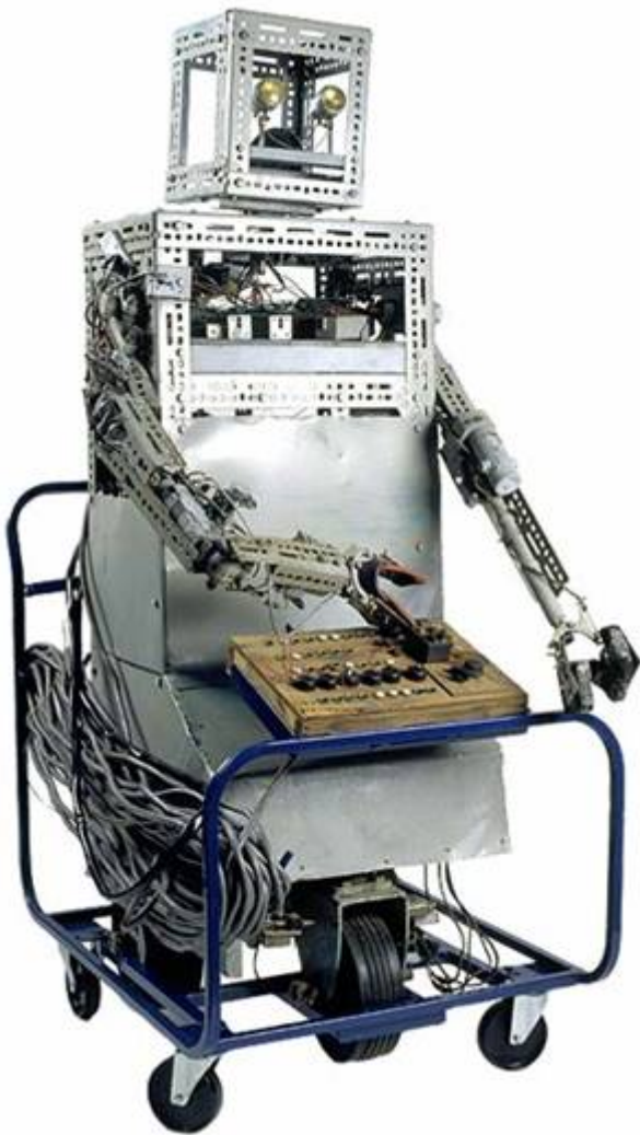
Robbie the Robot?

Robbie is not automatic like a robot. A robot, once programmed, can operate autonomously . . . well, until its energy supply runs out or it is told to stop! Robbie is, if anything, an ingenious set of adjustable spanners. It can only do its thing if it is operated by a human using the control panel.